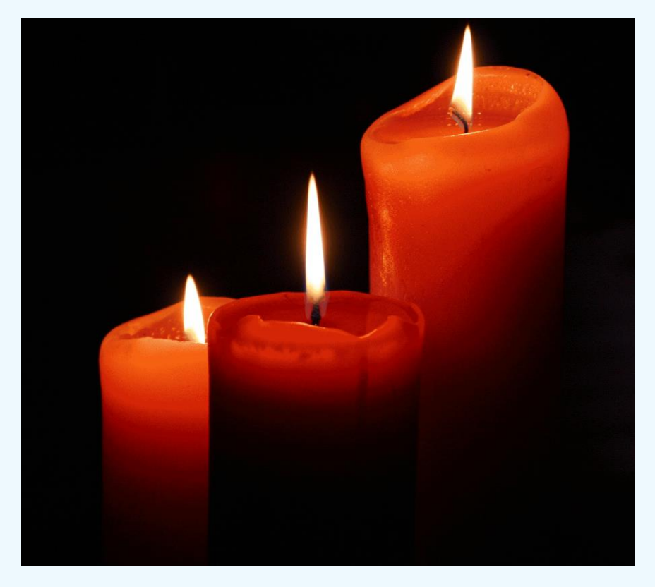
And also with you